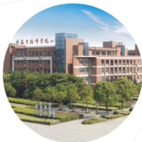
海宁技师学院 Haining Technician College