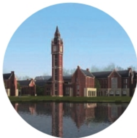
浙江大学国际联合学院 International Campus Zhejiang University