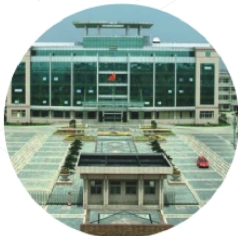
高新技术产业园区 High-tech Industrial Park