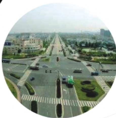
经济开发区 (漕河泾海宁分区) Haining Economic Development Zone Caohejing Hi-Tech Park haining partition