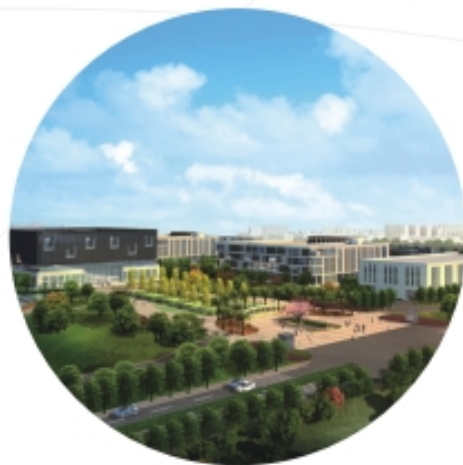
浙江机电职业技术学院 Zhejiang Institute of Mechanical & Electrical Engineering