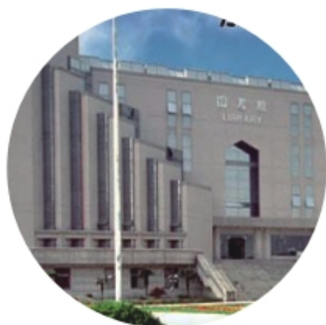
浙江财经大学·东方学院 Zhejiang University Of Finance And Economics Dongfang College

The Market Reform Experiment Area Of Human Resources In Zhejiang Province