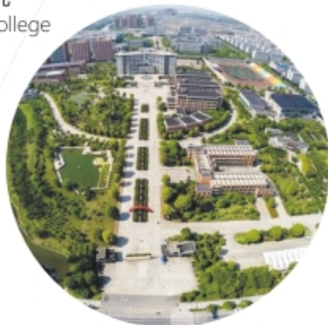
下沙高教园区 Xiasha Higher Education Campus