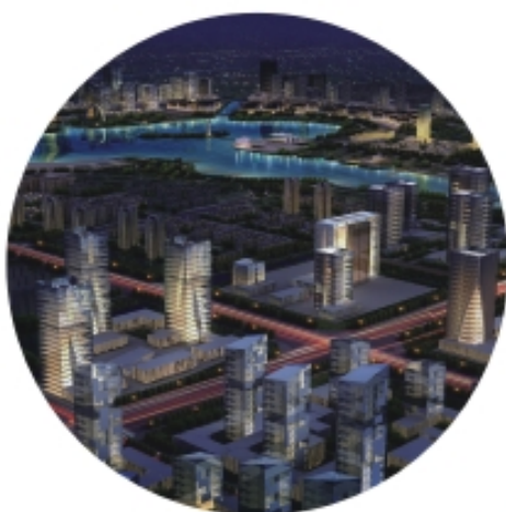
鹃湖国际科技城 Juanhu International Science And Technology City