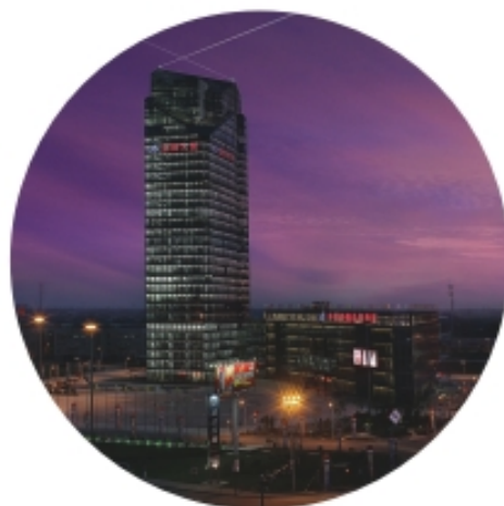
经编产业园区 Warp Knitting Industrial Park