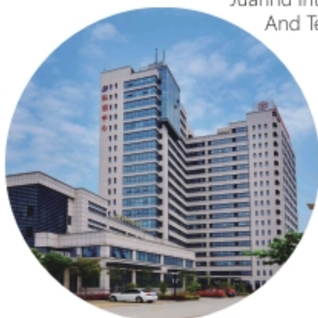
海宁科技创业中心(国家级) Haining Tech Entrepreneurship Centre ( national-level )